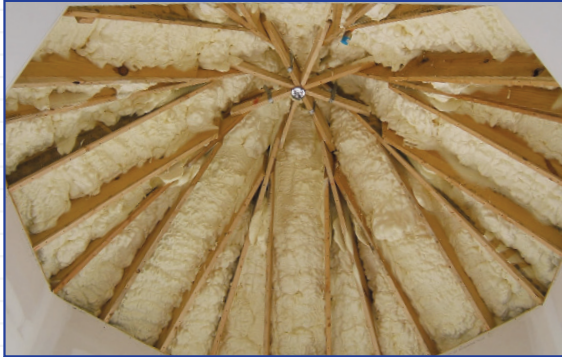
Icynene® soft foam insulation was carefully installed in the top of the two-storey entrance tower to minimize air movement and to insulate the home.