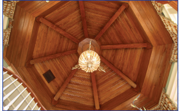
Decorative wood strip was applied with no problems because Icynene® effortlessly adheres to the cavity.