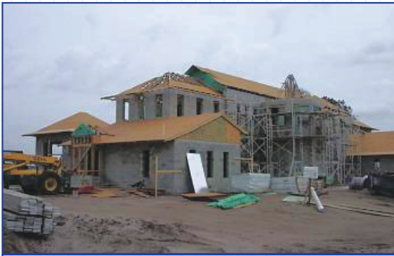
The New American Home® 2006 was certified by the Florida Green Building Coalition Inc. for using environmentally sound construction materials and principles, including The Icynene Insulation System®

At over 9,500 square feet, TNAH® 2006 is unlike any other in the program's 23-year history. With a distinctive, British-Caribbean flair, the home boasts a view of the lake from nearly every room. In addition to having such amenities as an "infinity pool," a spa, a master suite with a breakfast coffee station and laundry room, and a second-storey library, TNAH® 2006 was designed to be environmentally friendly.