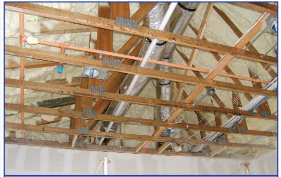
Icynene® was applied to the underside of the roof deck creating a sealed, unvented, and conditioned space for ductwork and air handlers.