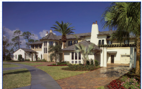
"We are proud to have built a home that blends cutting-edge building design with environmental sensibility," said builder Alex Hannigan